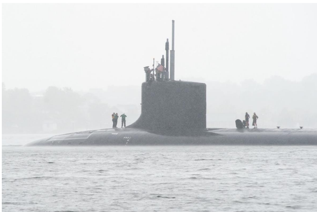
The Virginia-class attack submarine USS Oregon (SSN 793)

Each year, we join our partners in the Submarine Industrial Base Council (SIBC) in recognizing National Submarine Day. Along with more than 5,000 U.S. companies providing critical materials to the U.S. submarine programs, members range from the smallest specialty shops to manufacturers of main propulsion equipment.