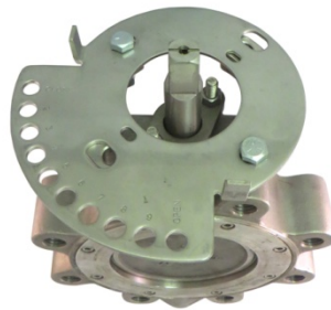
2. LATCH PLATE MOUNTING